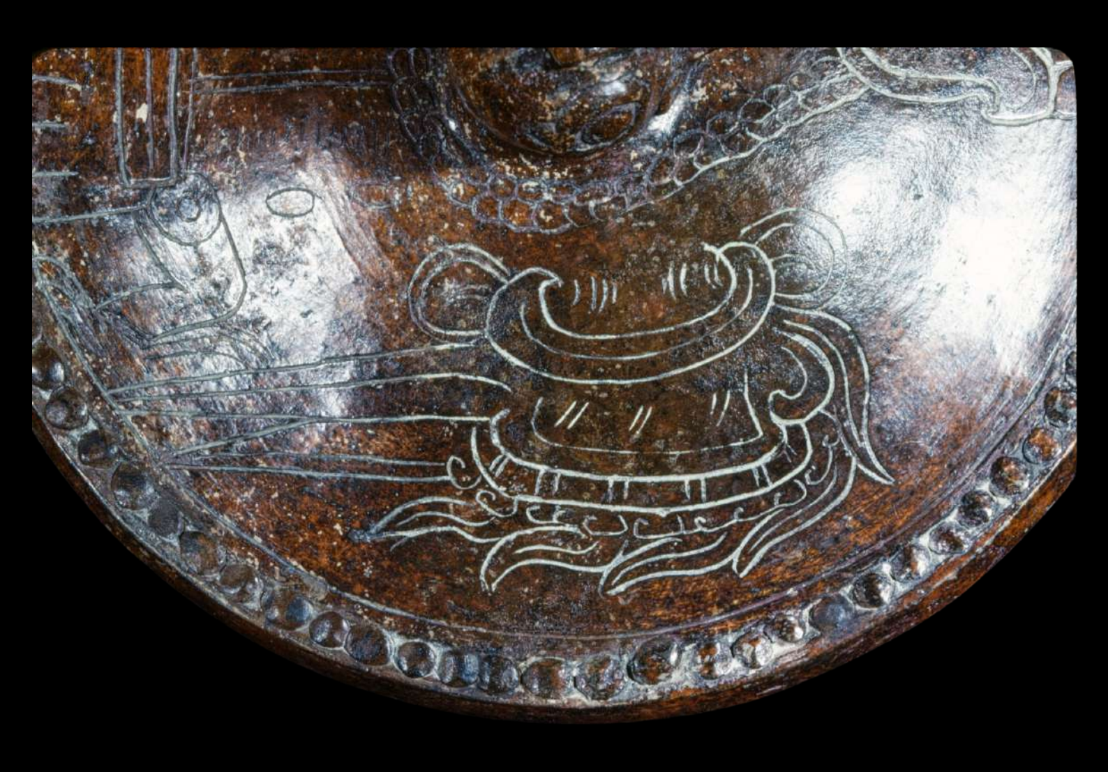
Most birds' wings are shown as long-snouted reptile faces.