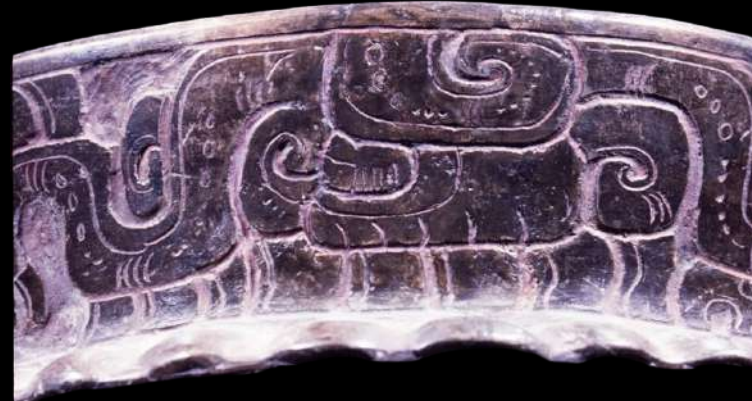
Gouged incised decoration on the other side of the bowl.