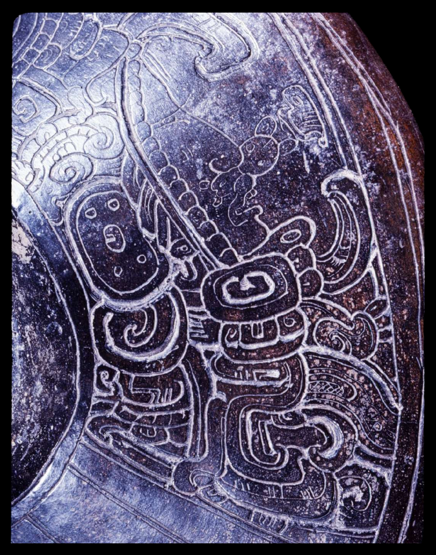
Large curled long-snouted reptile head under the man's head. Small curled long-snouted reptile head under the earring. The man's head is surrounded by a row of overlapping ovals (just as on 2-dimensional cache vessels).