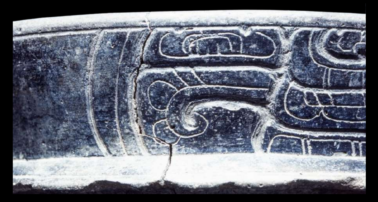
Design on the side of the bowl.