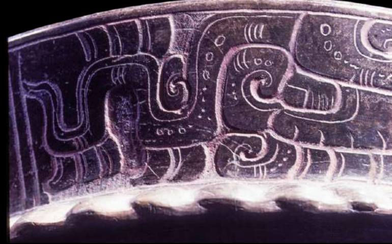
Gouged incised decoration on the side of the bowl.