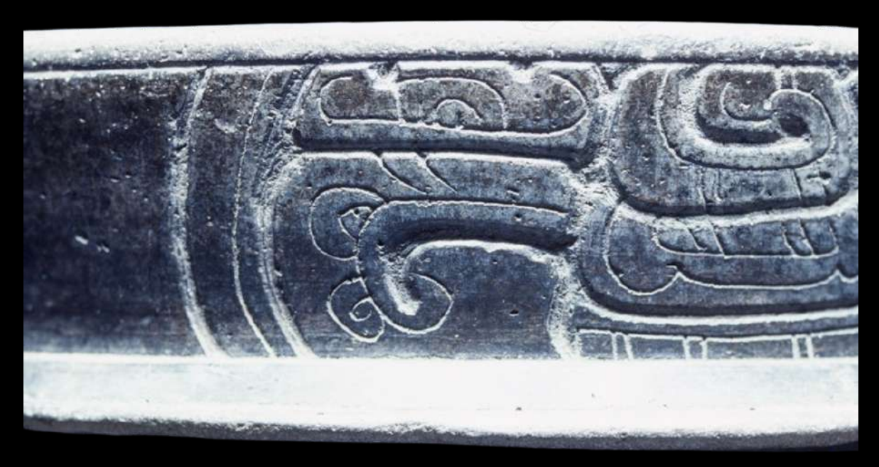
Desing on the other side of the bowl.