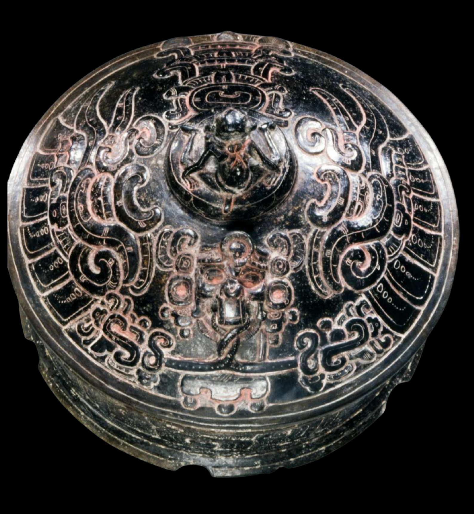
Lid of a basal flange bowl with the Principal Bird Deity.