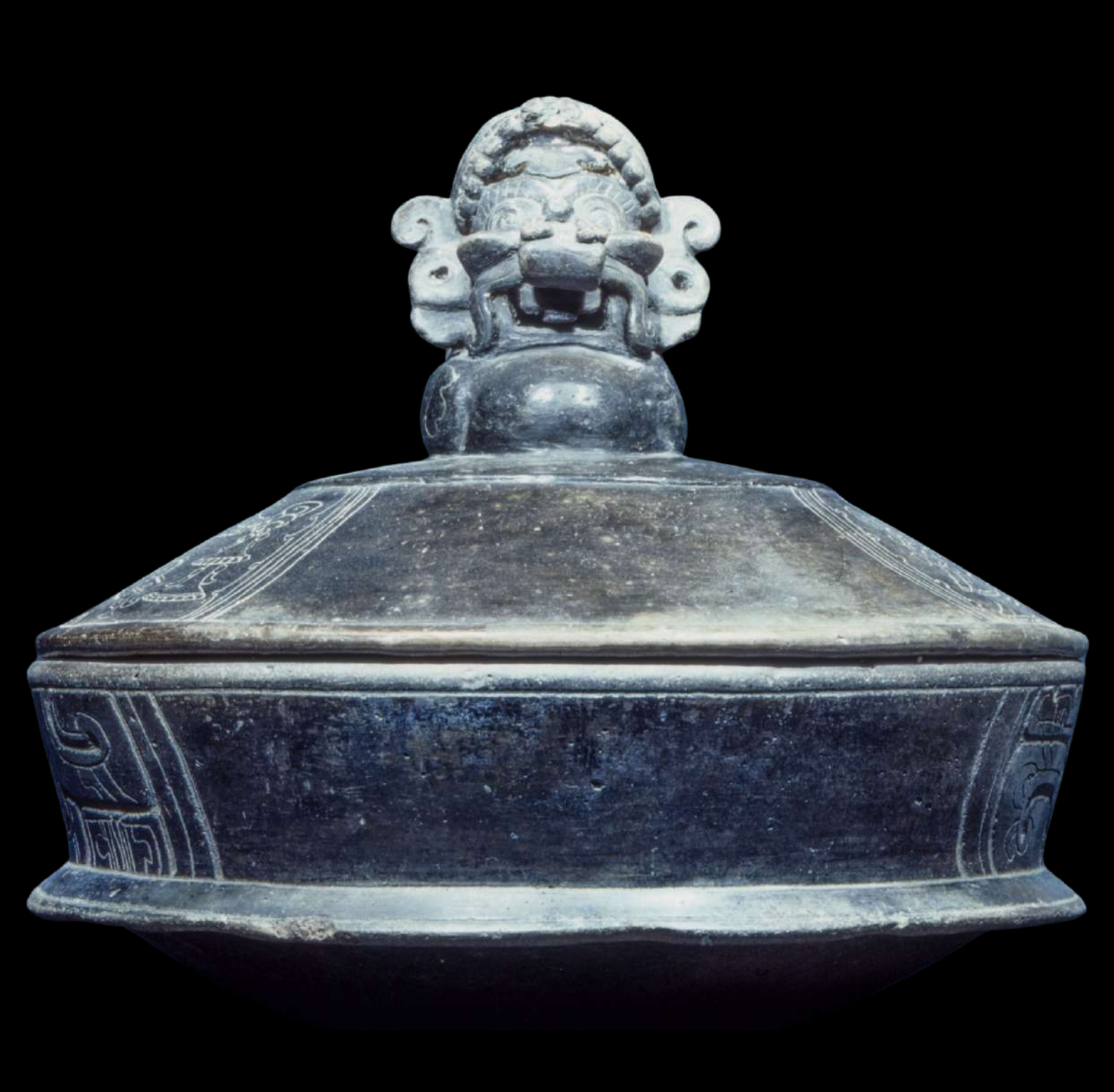
Front of the Principal Bird Deity.