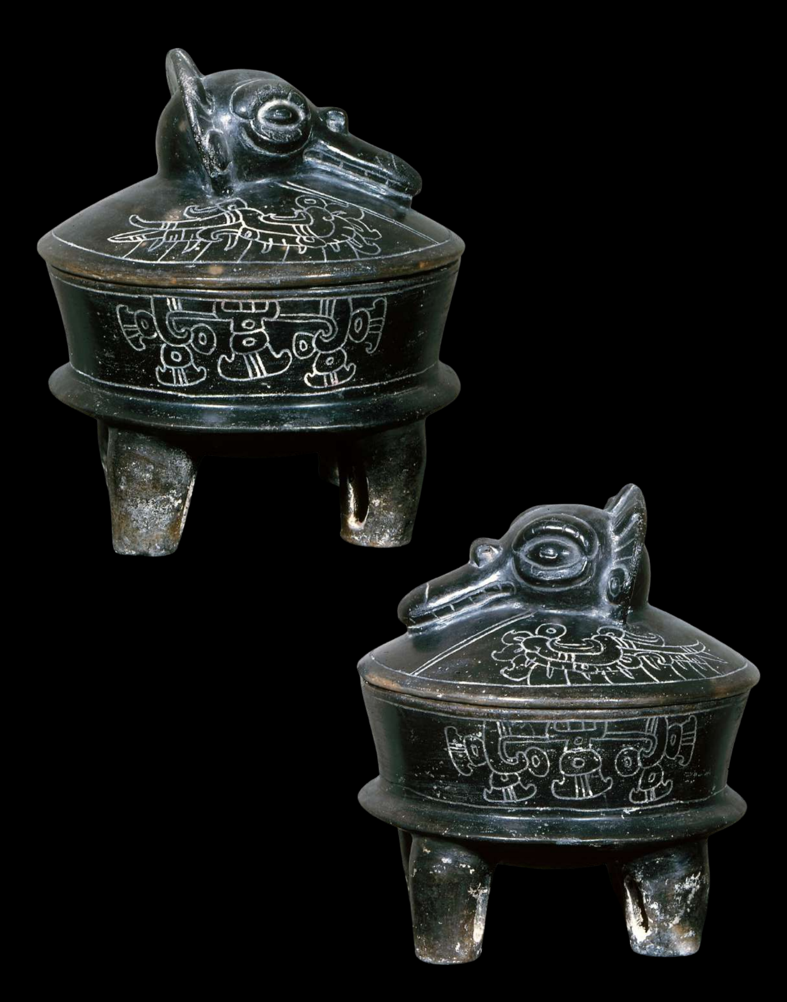
Waterbird. The long-snouted reptile face on both sides are the wings. This basal flange bowl has four supports.