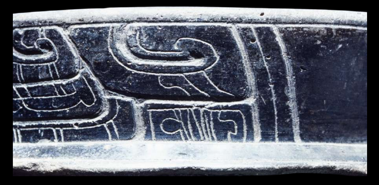
Design on the side of the bowl.