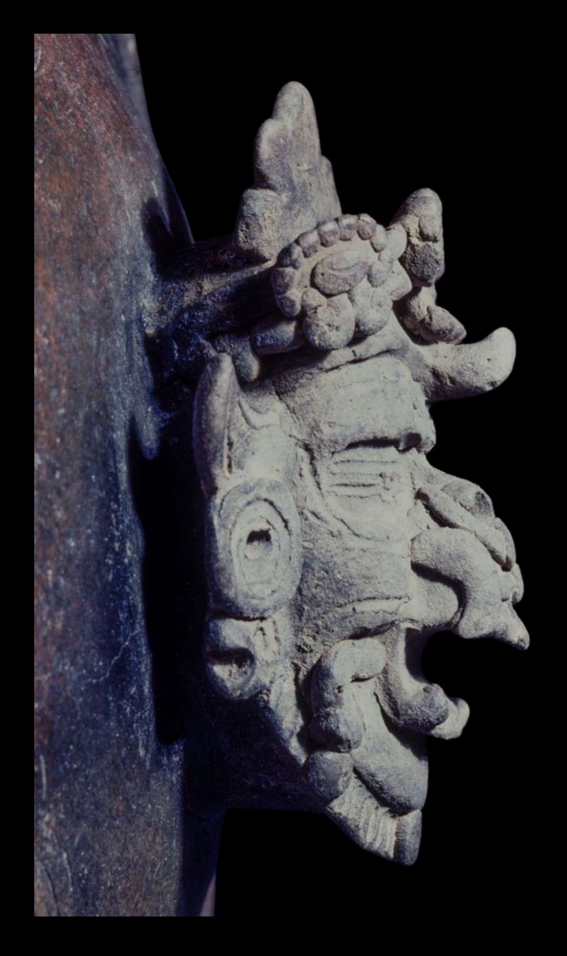
Lid handle of a basal flange bowl. I have turned it sideways so you can see the bearded deity face.