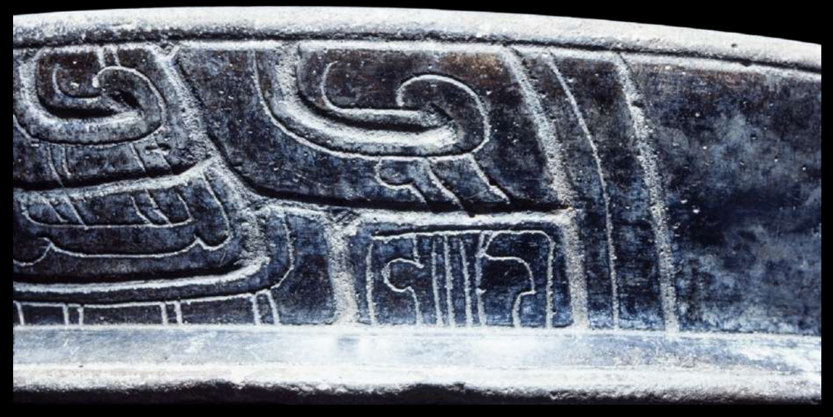
Desing on the other side of the bowl.