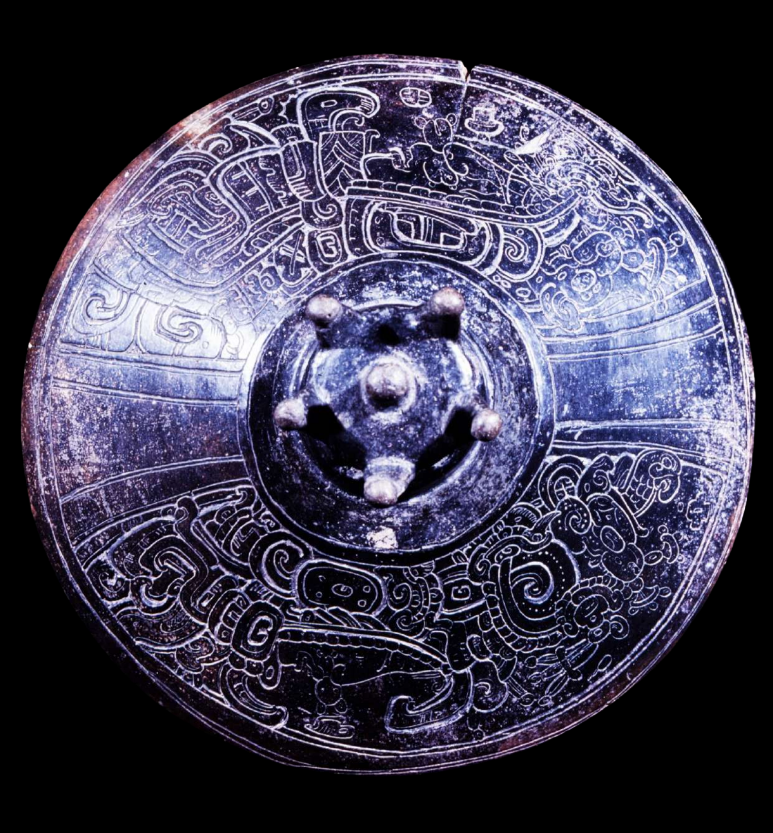
Faces of Maya men with impressive headdresses.