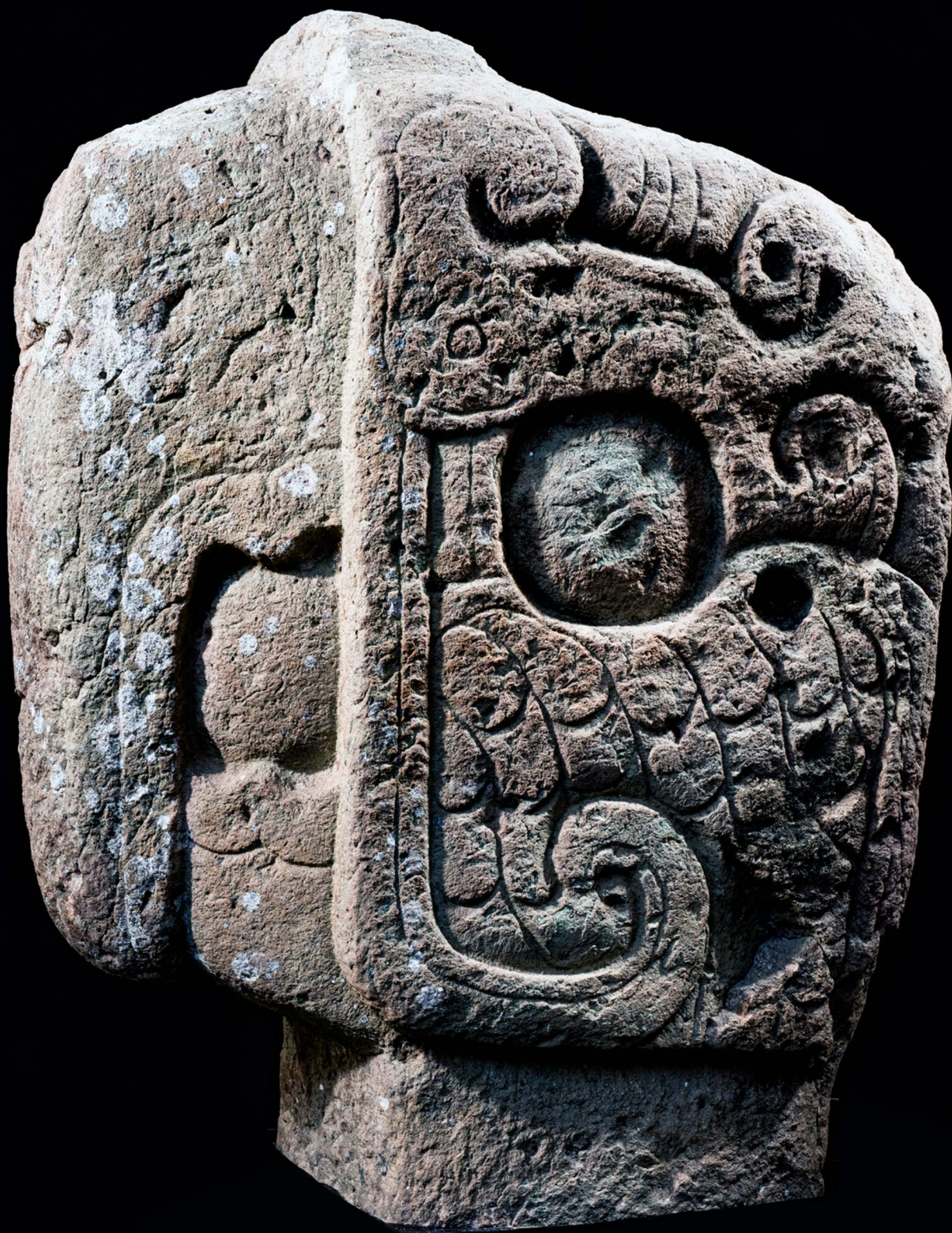
Scarlet macaw, Maya ballgame ballcourt goalstone, Copan Sculpture Museum. 3:45pm, February 3, 2024.