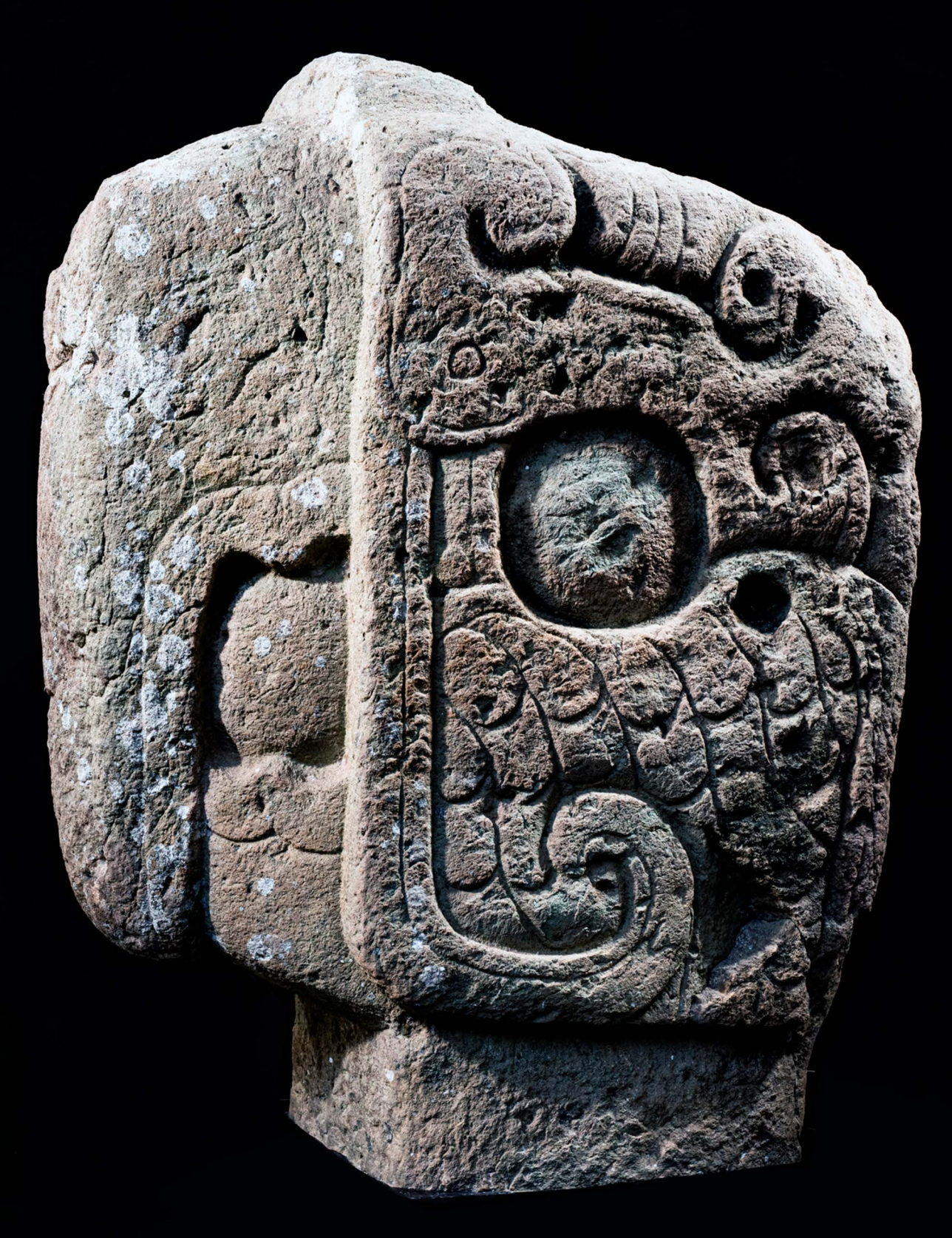
Scarlet macaw, Maya ballgame ballcourt goalstone, Copan Sculpture Museum. Nikon D-810. 3:45pm, February 3, 2024.