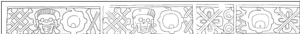
Skull alternating with Crossed Bones in various styles, plus "mystery motif" that the presentation will discuss. Cropped by Norma Cho Cu from Uxmal, Monument 3.